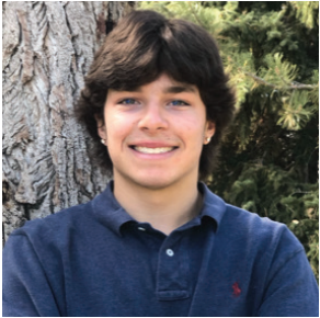
Stolle Hall Richmond Critical Improvements School: Colorado State University; Mechanical Engineering Graduation: May 2025